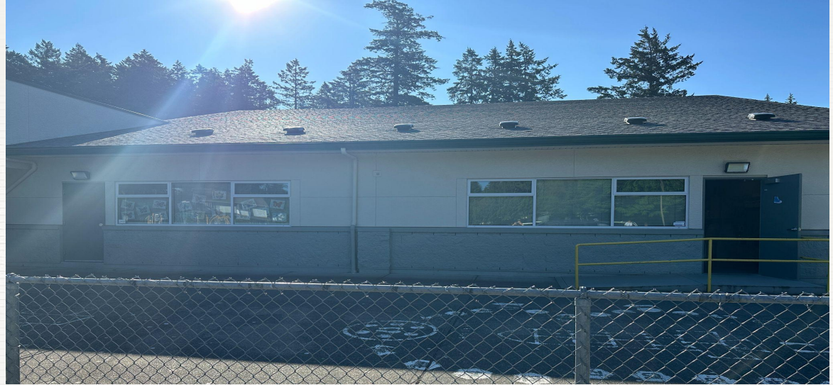
Front of the school

All students wait outside in a class line up for their teacher to greet them in the morning. The teacher will lead the students into the classroom from the front of the school.